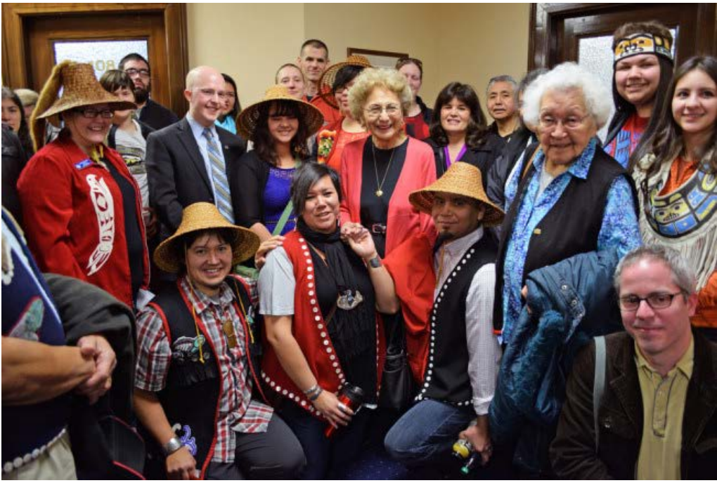
Rep. Jonathan Kreiss-Tomkins (in suit coat and blue shirt) and supporters of House Bill 216 gather in a Capitol hallway for a group photo to celebrate passage of the bill through the House State Affairs Committee. The bill would symbolically make 20 Alaska Native languages official state languages alongside English. <a href="http://www.ktoo.org/2014/04/01/alaska-native-languages-bill-clears-final-house-committee/">http://www.ktoo.org/2014/04/01/alaska-native-languages-bill-clears-final-house-committee/</a>

http://www.adn.com/article/20140423/alaskas-official-indigenous-languages-and-emotions-revitalization