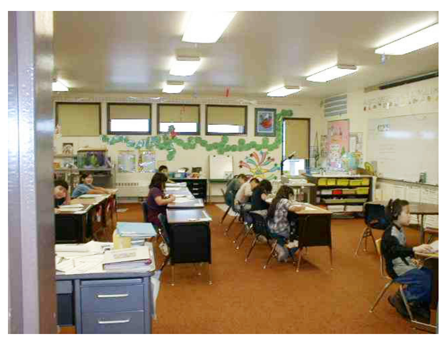
School in Nondalton

Recommendation: Within the Department of Education and Early Development, create a Division of Indigenous Languages that supports Alaska Native language teachers, programs, and schools and teachers.